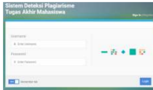
Fig. 2 Login Page

After the user has successfully logged into the system, the user will be automatically directed to the start menu page. The homepage will display a list of theses that have been submitted by students as well as thesis data that have been received and validated by the Head of Study Program and BAA (Academic Administration Bureau) STIKI Malang.