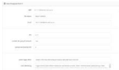
Fig. 4 Submission of student thesis

Figure 4 explains that students input data into the input-form provided by the system then make submissions by pressing the save button. After the data is successfully saved, the plagiarism check button will automatically appear.