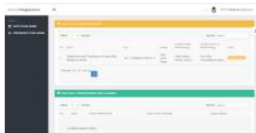
Fig. 3 Dashboard Menu

After the user has successfully logged into the system, the user will be automatically directed to the start menu page. The homepage will display a list of theses that have been submitted by students as well as thesis data that have been received and validated by the Head of Study Program and BAA (Academic Administration Bureau) STIKI Malang.