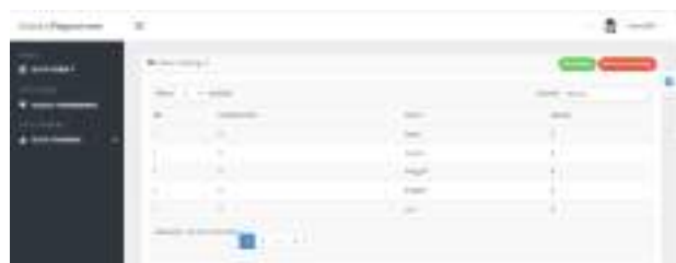
Fig. 7 Term Frequencies

Figure 7 shows the frequency term list page where the training data input is processed using preprocessing and TF-IDF to produce terms from each training data document. The terms generated from the preprocessing process and TF-IDF are used to make comparisons with the submitted test data documents, which later on the system will perform calculations and get the results of the similarities of each document.