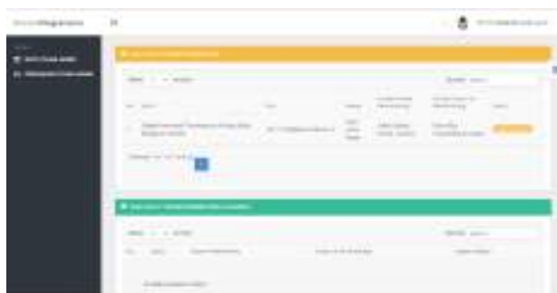
Fig. 3 Dashboard Menu

After the user has successfully logged into the system, the user will be automatically directed to the start menu page. The homepage will display a list of these that have been submitted by students as well as thesis data that have been received and validated by the Head of Study Program and BAA (Academic Administration Bureau) STIKI Malang.