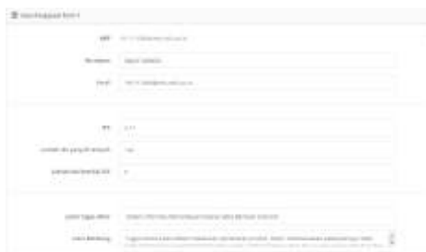
Fig. 4 Submission of student thesis

Figure 4 explains that students input data into the input-form provided by the system then make submissions by pressing the save button. After the data is successfully saved, the plagiarism check button will automatically appear.