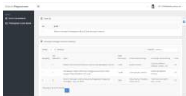
Fig. 5 Plagiarism Result using Cosine Similarity

documents with each training document to determine the similarity level of the submitted documents. After the level of data similarity in the final project is detected, the results will be displayed and sorted according to the document similarity ranking percentage. Details of the final project data that have been submitted will also be displayed here (see figure 5). If the similarity of documents is more than 80%, the university has the right to refuse the final project that has been submitted. Conversely, if the university receives the submitted thesis data, it will automatically update the status of the submitted thesis data on the thesis data page to be 'accepted'.