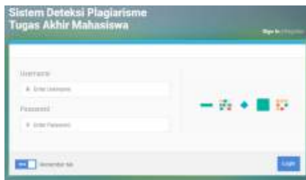
Fig. 2 Login Page

After the user has successfully logged into the system, the user will be automatically directed to the start menu page. The homepage will display a list of these that have been submitted by students as well as thesis data that have been received and validated by the Head of Study Program and BAA (Academic Administration Bureau) STIKI Malang.