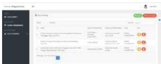
Fig. 6 List of Training Data

To calculate the submitted thesis data or what is called test data, comparative data or training data are needed to determine the similarity with the submitted documents. The training data is filled in by the university and then displayed on the training data list page. Figure 6 shows the application not only displays a list of training data, but universities can also process training data, where the data is processed and converted into frequency terms.